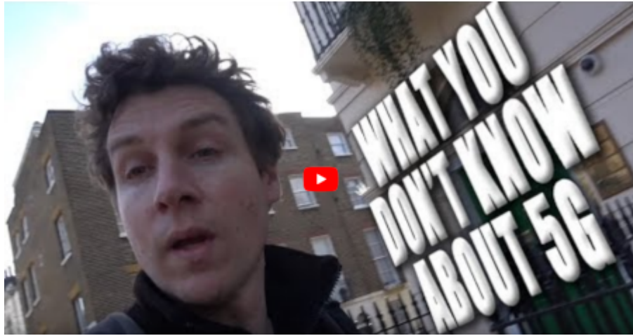
What You Don't Know About 5G.