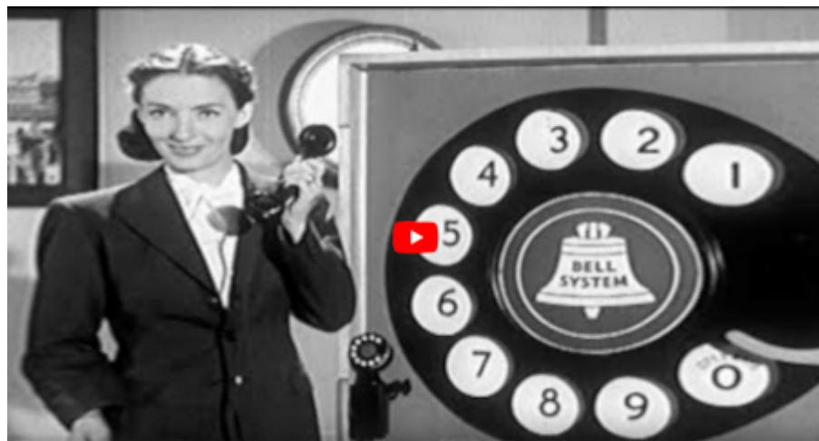
Burt Wolf - A Short Guide to Cell Phone Safety.