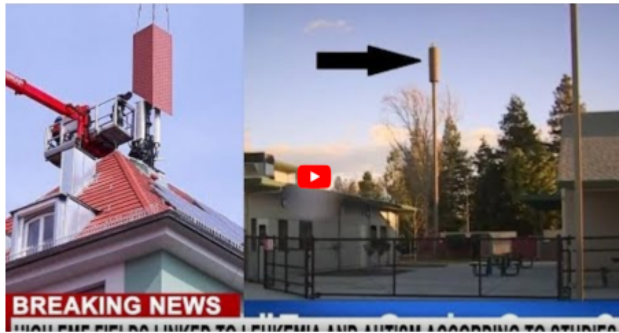
4G Killed 23,482 Americans Last Year - New Study.