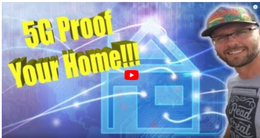
How To 5G Proof Your House. This Is Next Level EMF Protection!