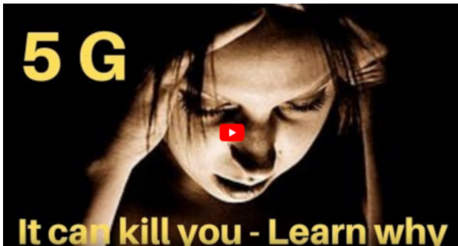
5G Can Kill You - Find Out Why.