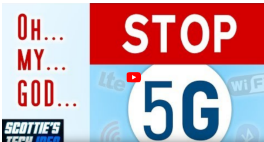
5G Rollout Runs into Roadblocks.