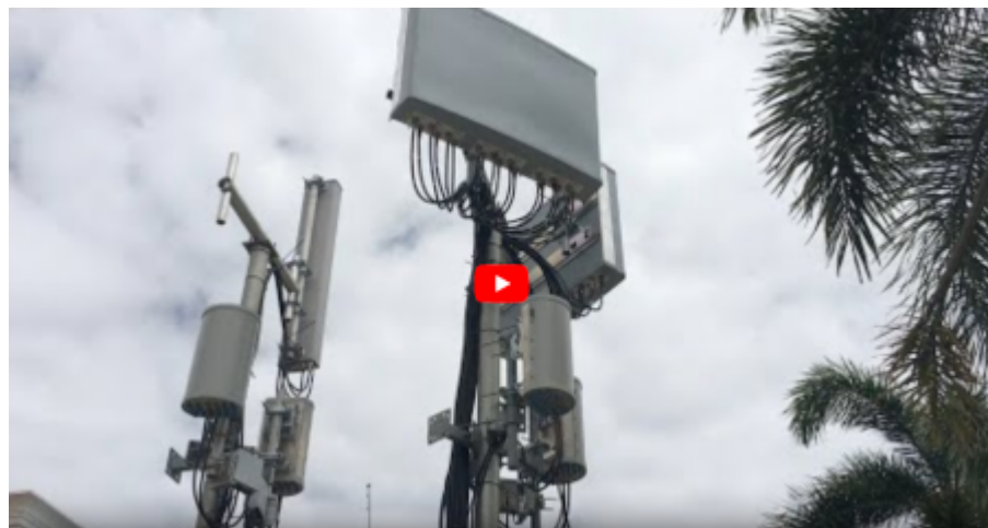
Burt Wolf - The Danger of RF Radiation.